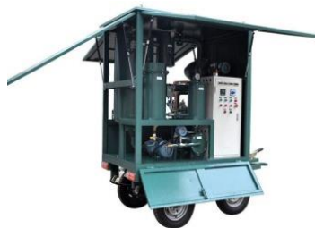
Double axles trailer