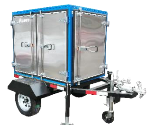
Single axle trailer